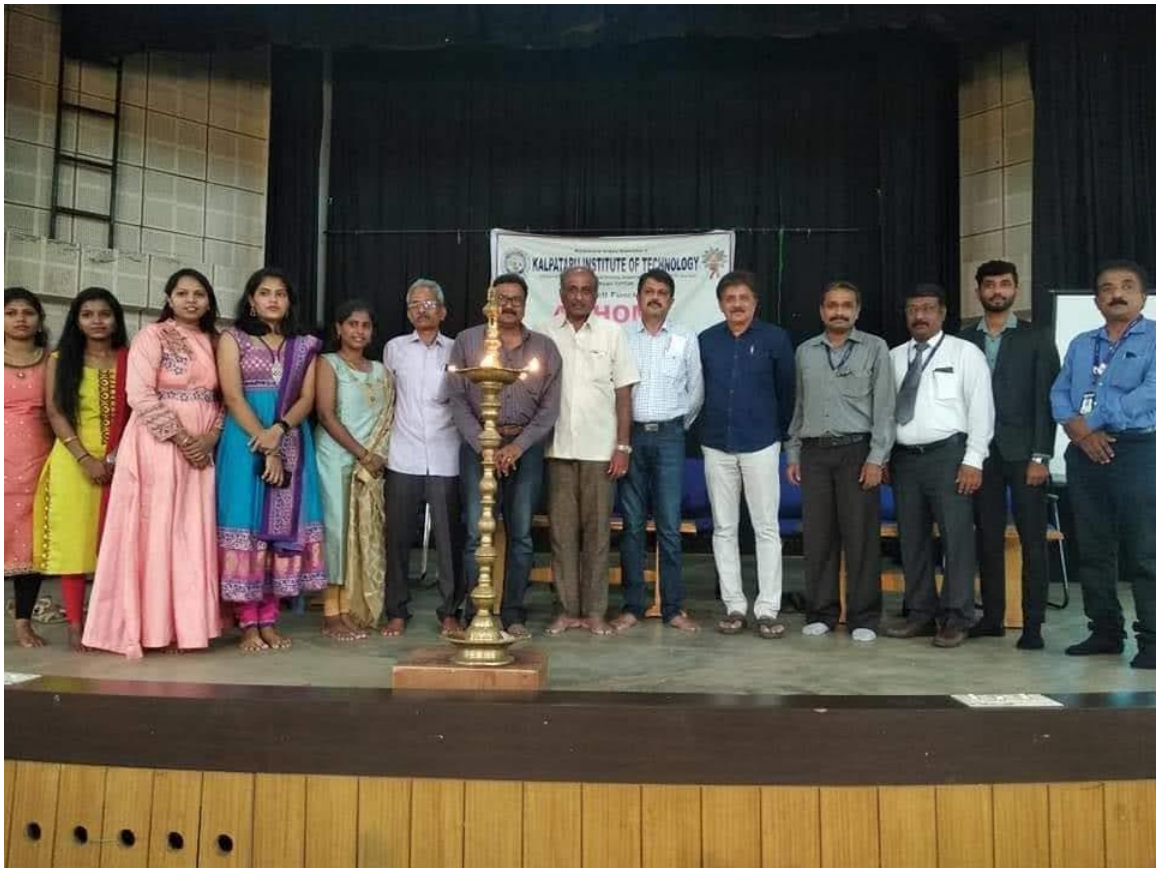
AT HOME Celebration