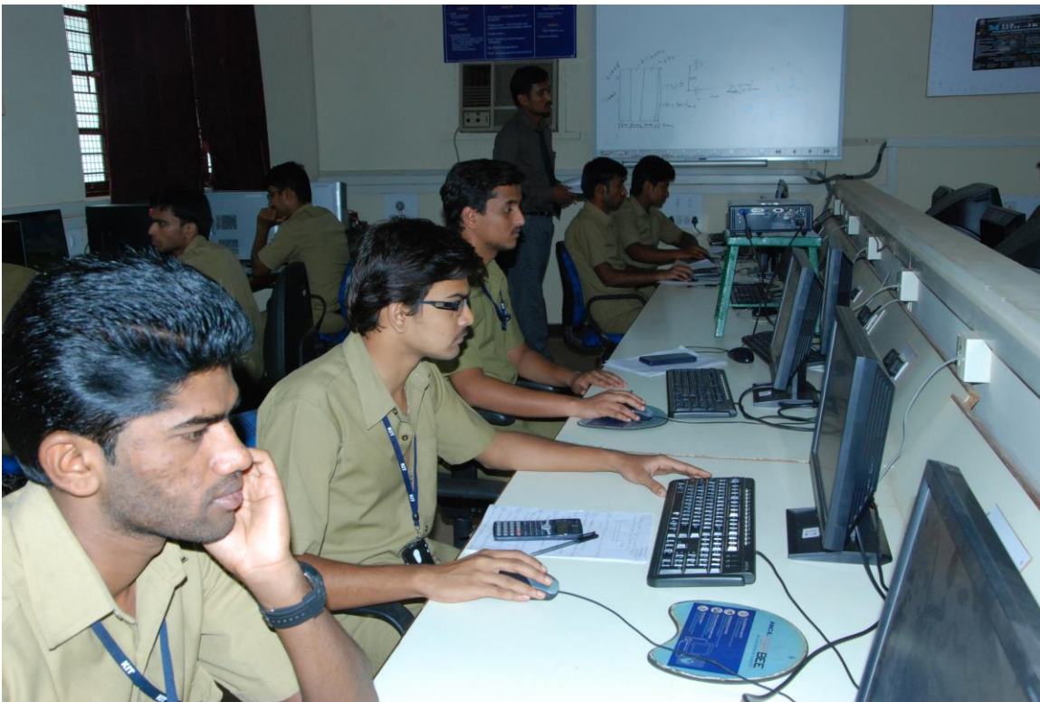
Department of Mechanical Engg, CAD-CAM lab