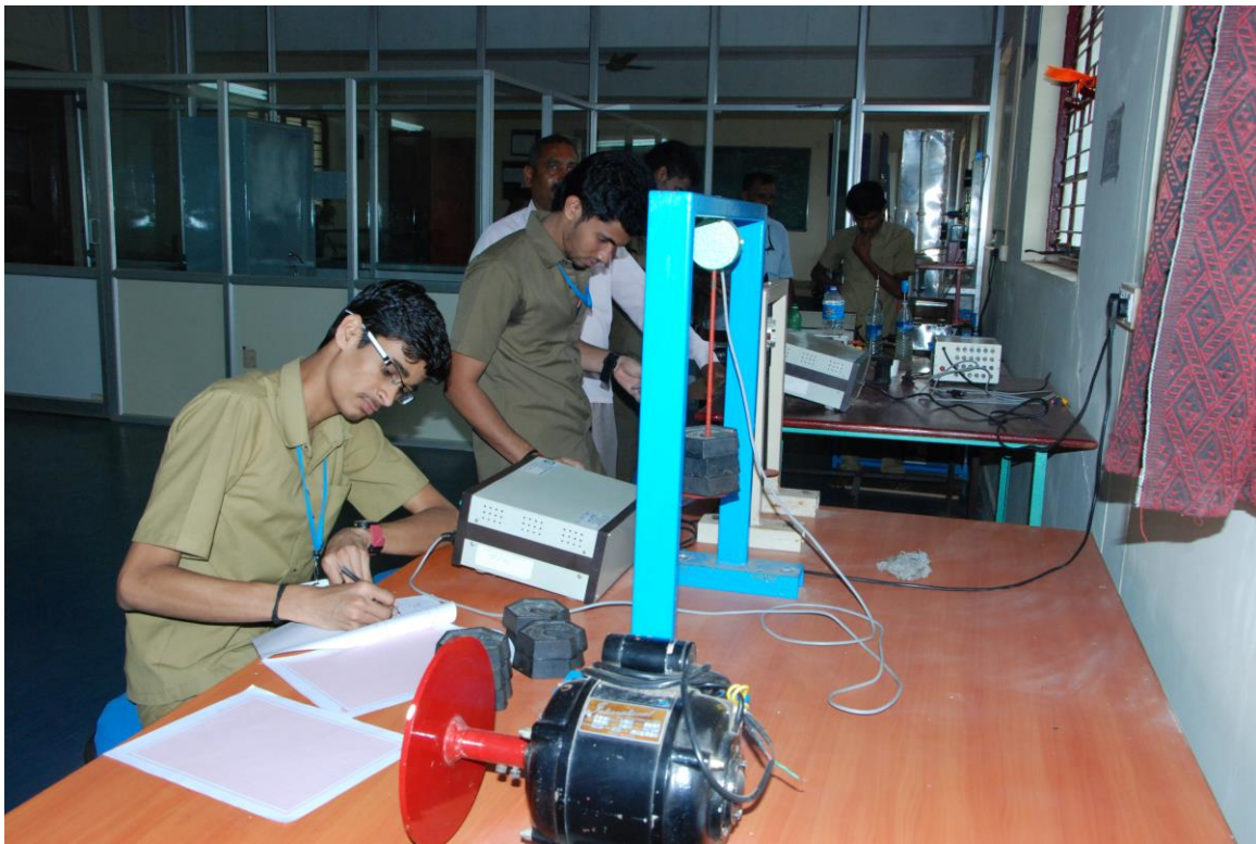
Department of Mechanical Engg, Metrology and Metrology Lab