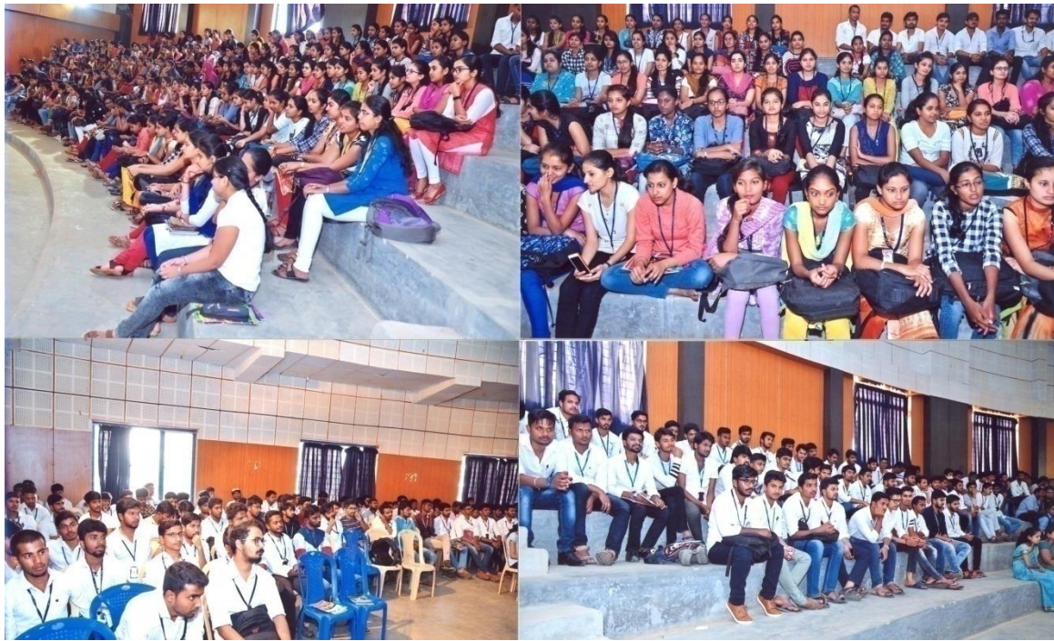
AUDIENCE AT MICROSOFT-PLATIFI FUNCTION IN KIT- AUDITORIUM