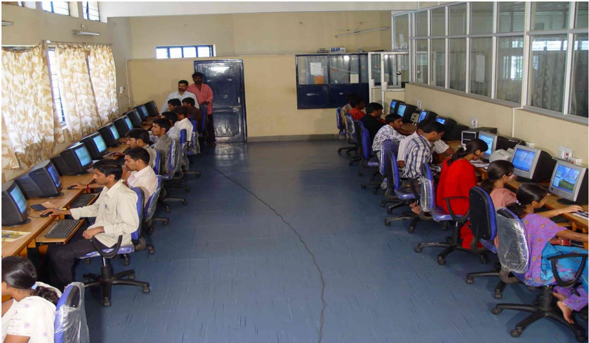
Dept. of Electronics & Communication Engg. Microprocessor Lab / HDL Lab