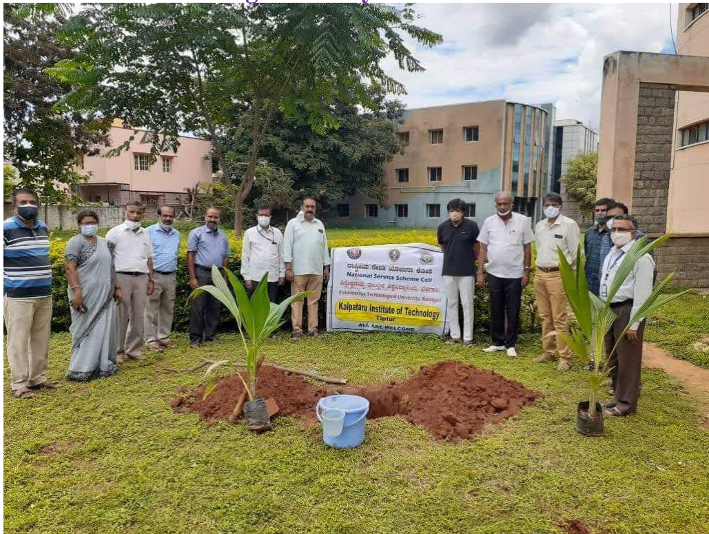
Environmental Day Celebrated