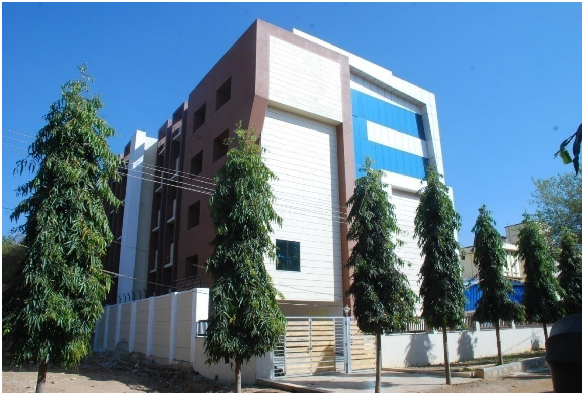
Girls Hostel for Freshers