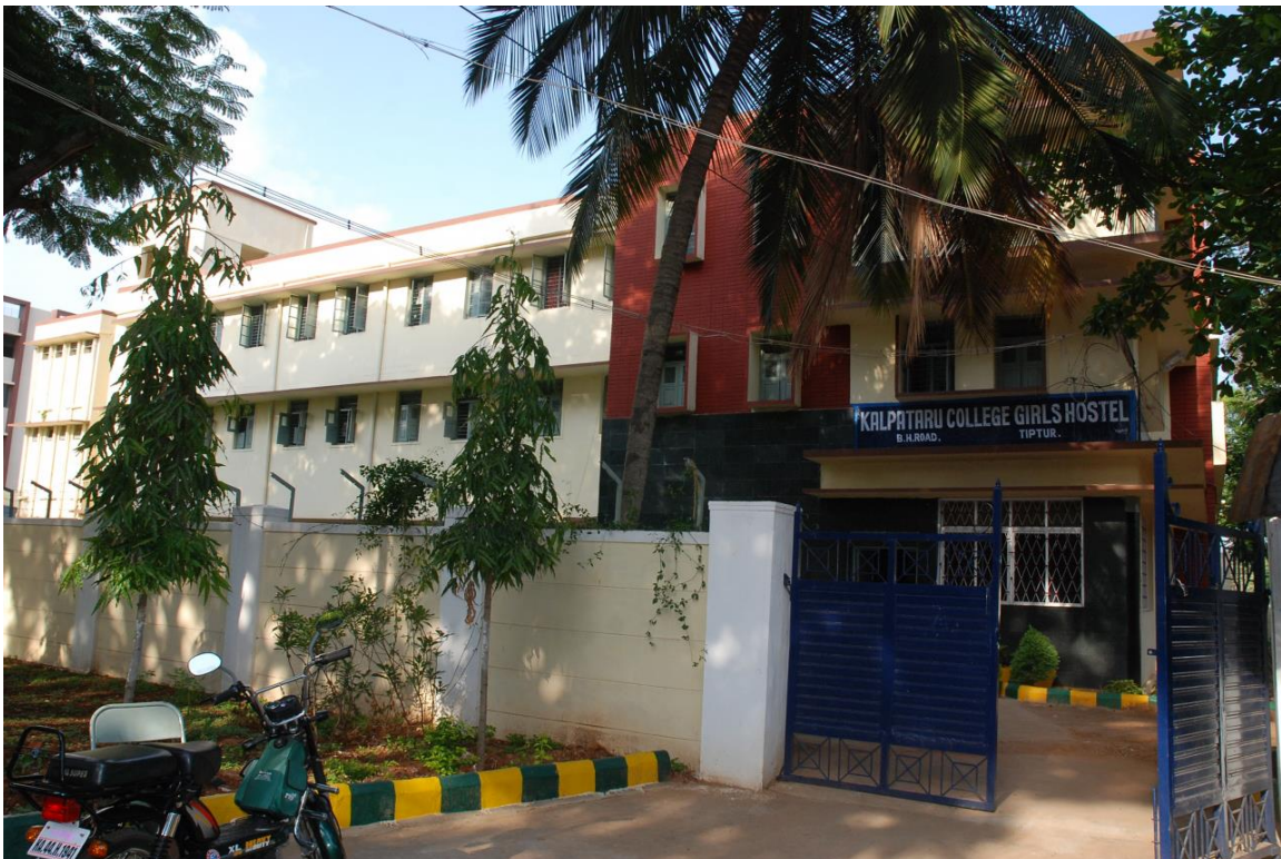
A View of Girls Hostel