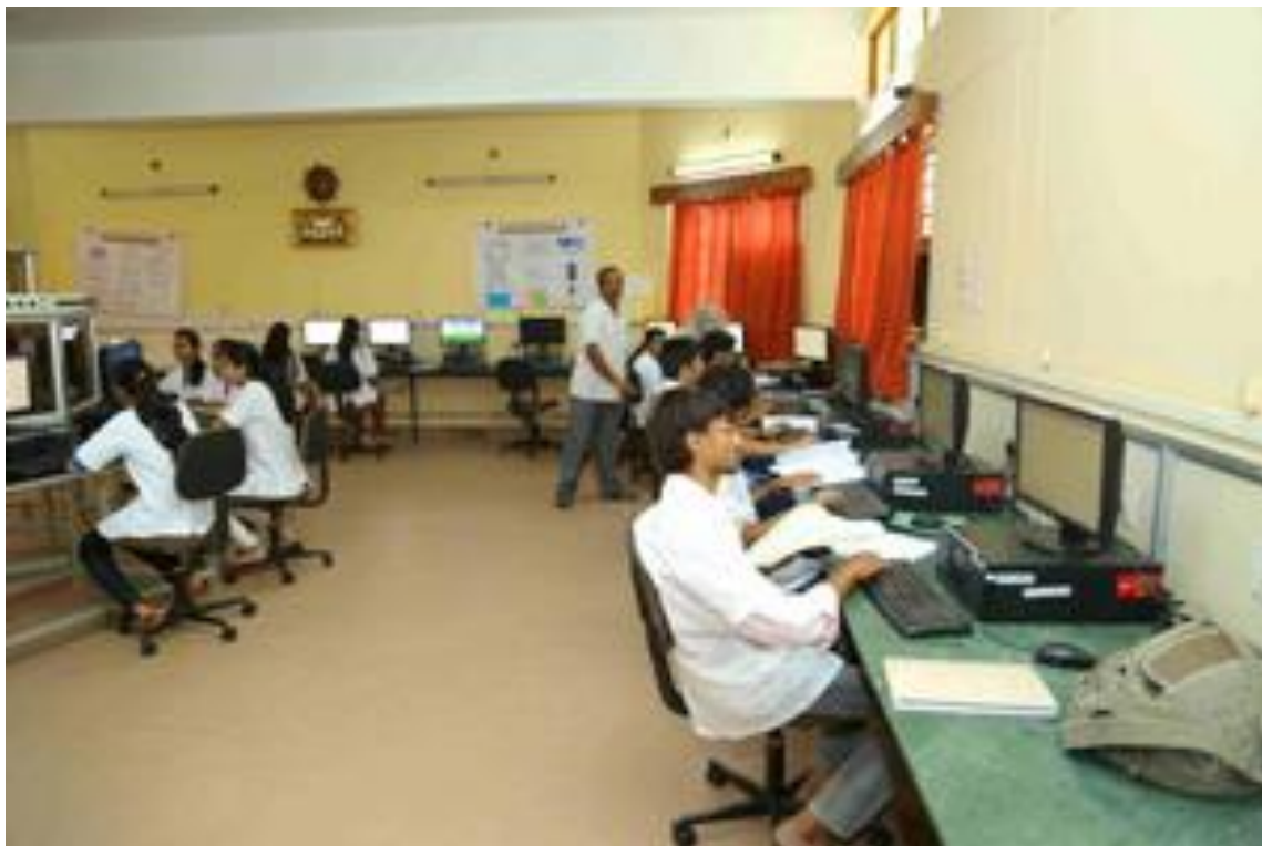
Department of CSE, Data Structure Laboratory