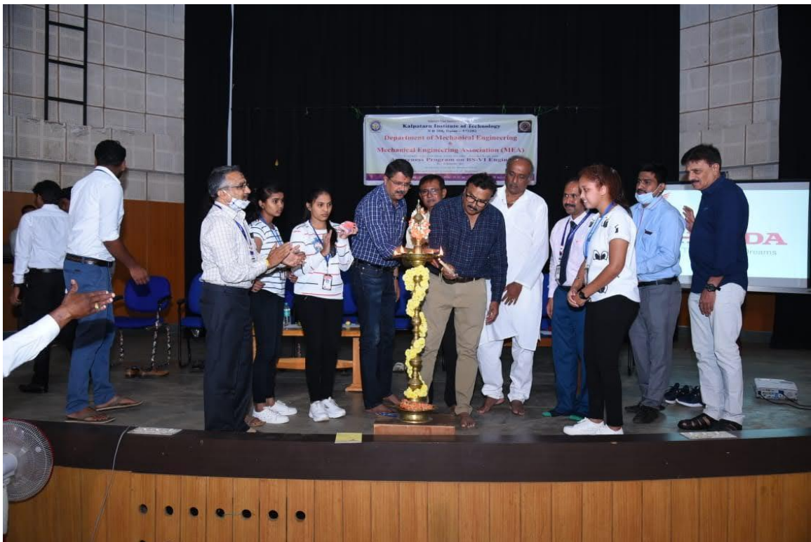
Awareness Program on BS-VI Engine