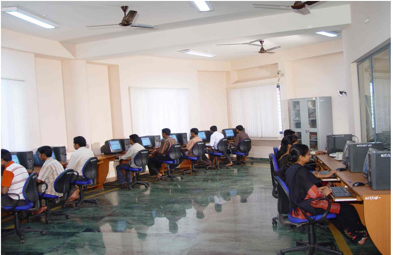
Library – Digital Library