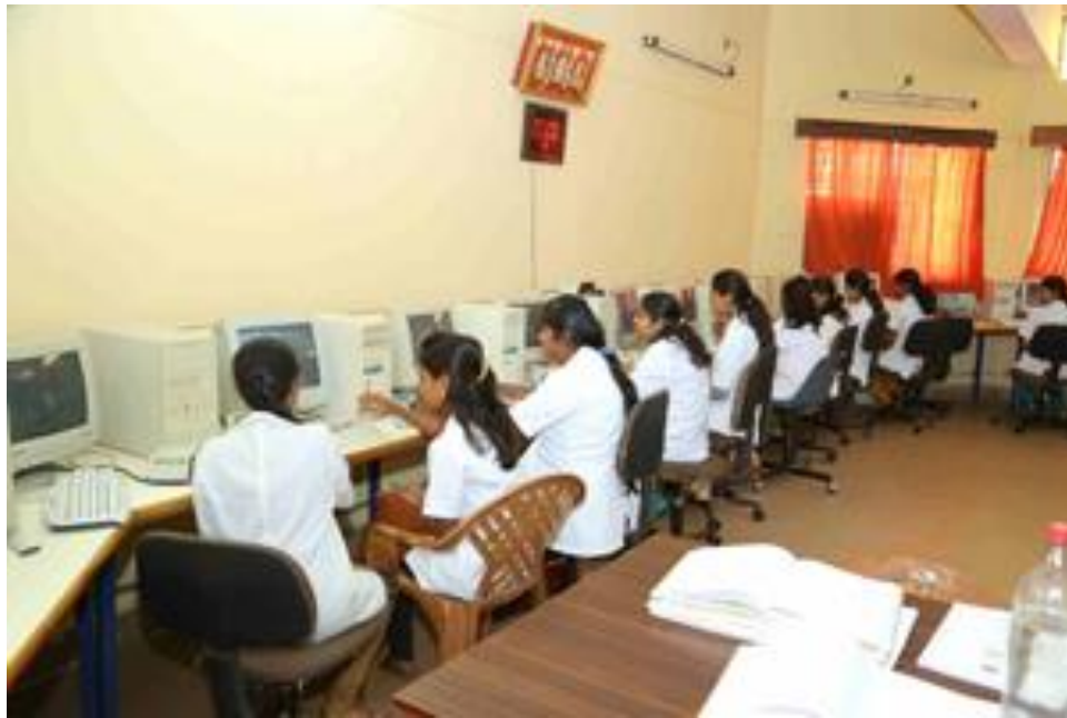
Department of CSE, Microprocessor Laboratory