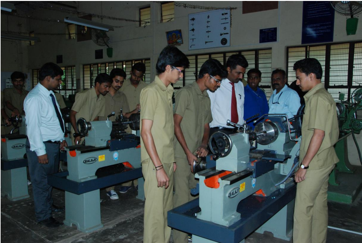
Department of Mechanical Engg, Machine Shop