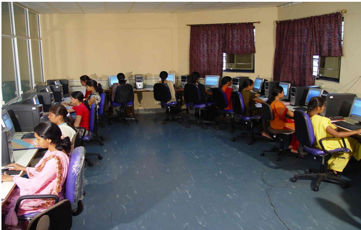
Dept. of Electronics & Communication Engg. VLSI Lab