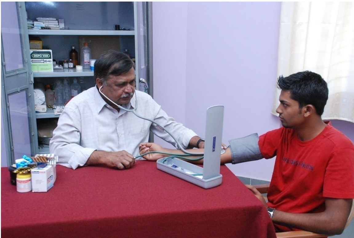
Medical & other facilities at Hostel