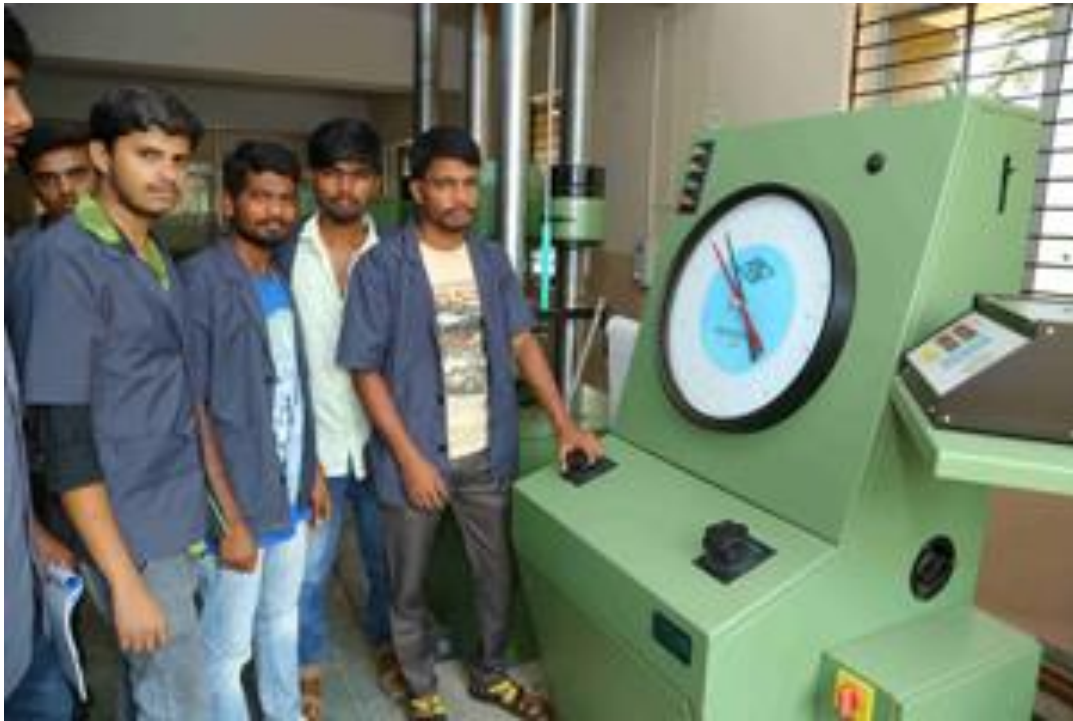
Department of Civil Engg, BASIC MATERIAL TESTING LAB