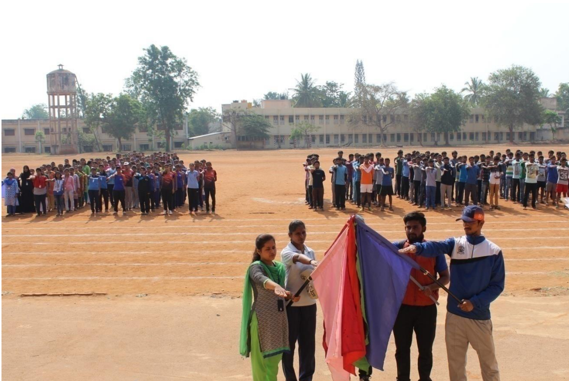
Annual Athletics Meet