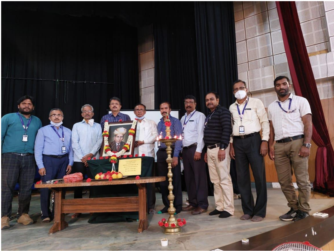
Engineers Day Celebrated