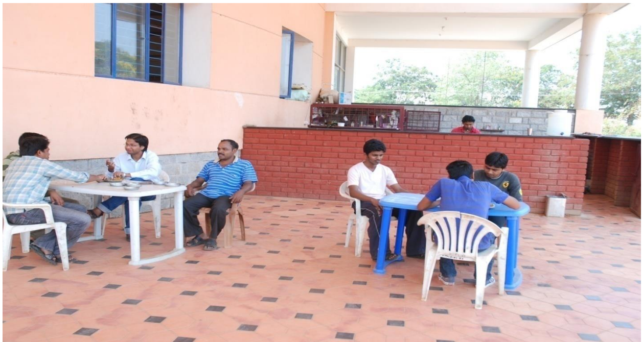
Canteen SPORTS FACILITIES