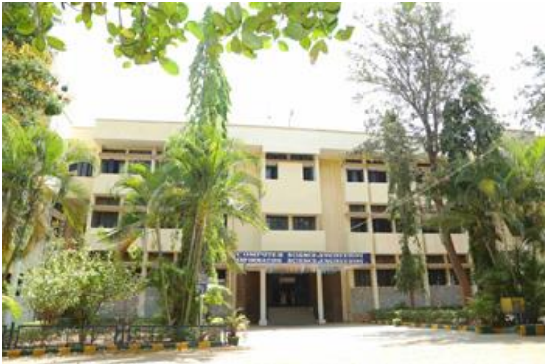
CSE/ISE Department Front View