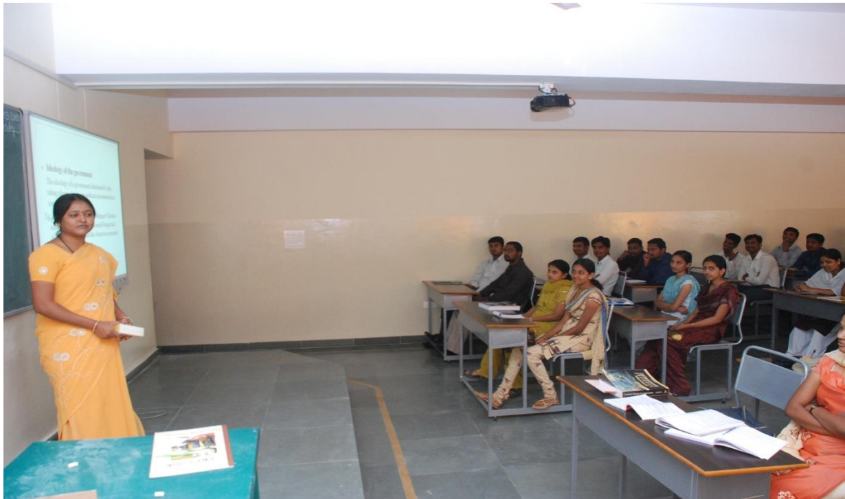
Digital Class Room