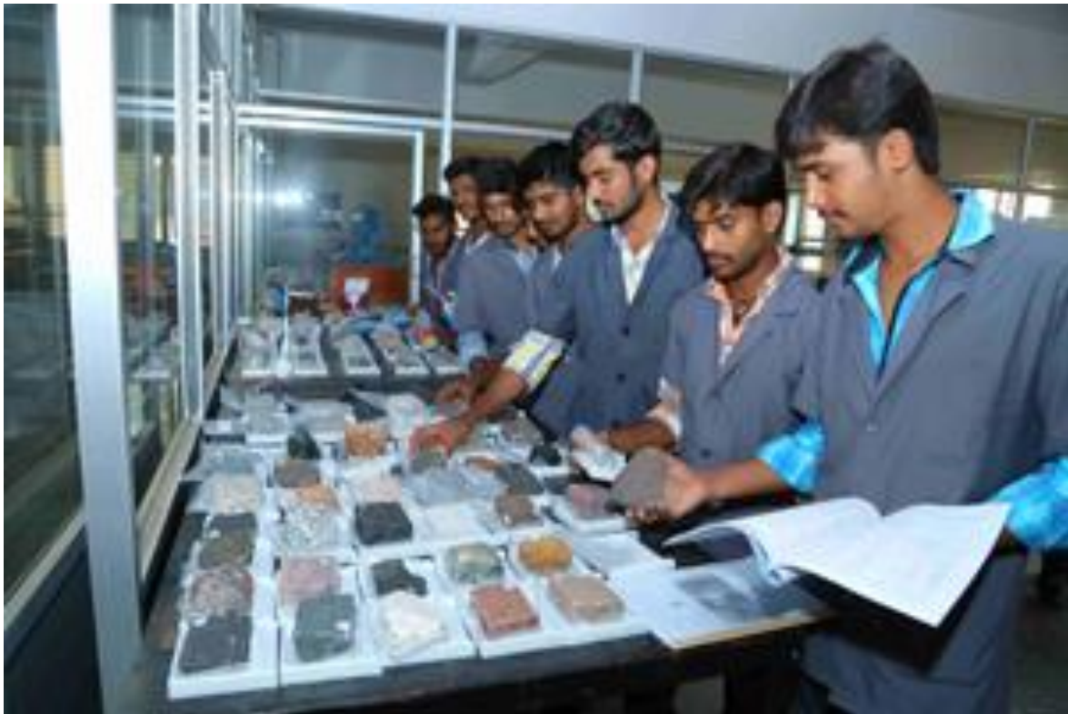
Department of Civil Engg, APPLIED ENGINEERING GEOLOGY LABORATORY