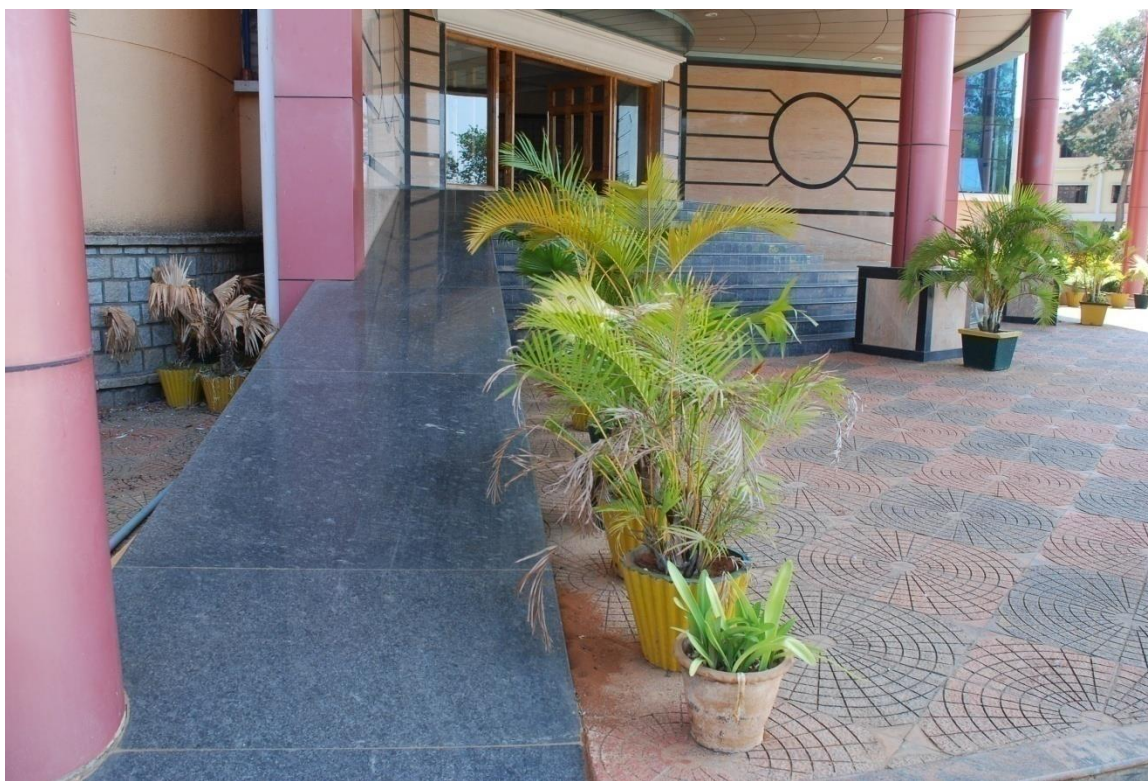
Ramp facility for disabled