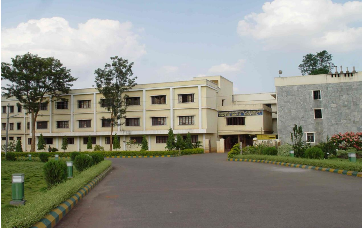
A View of Boys Hostel