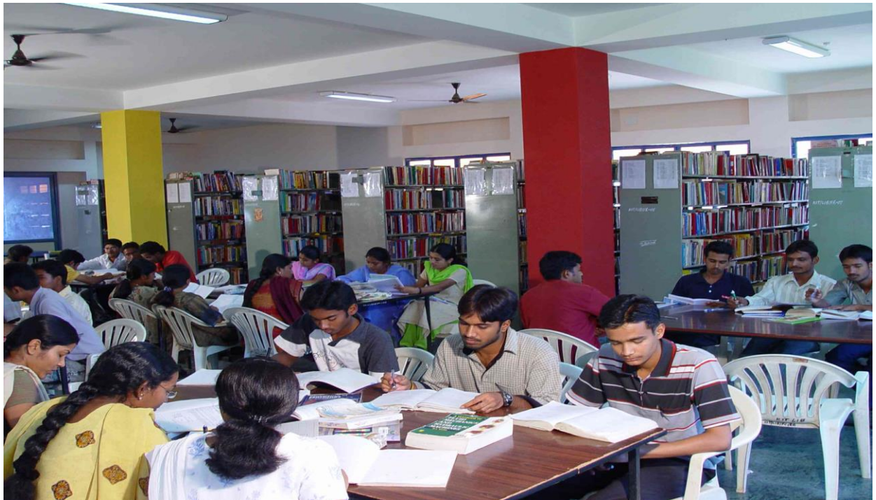
Library – Reference Section