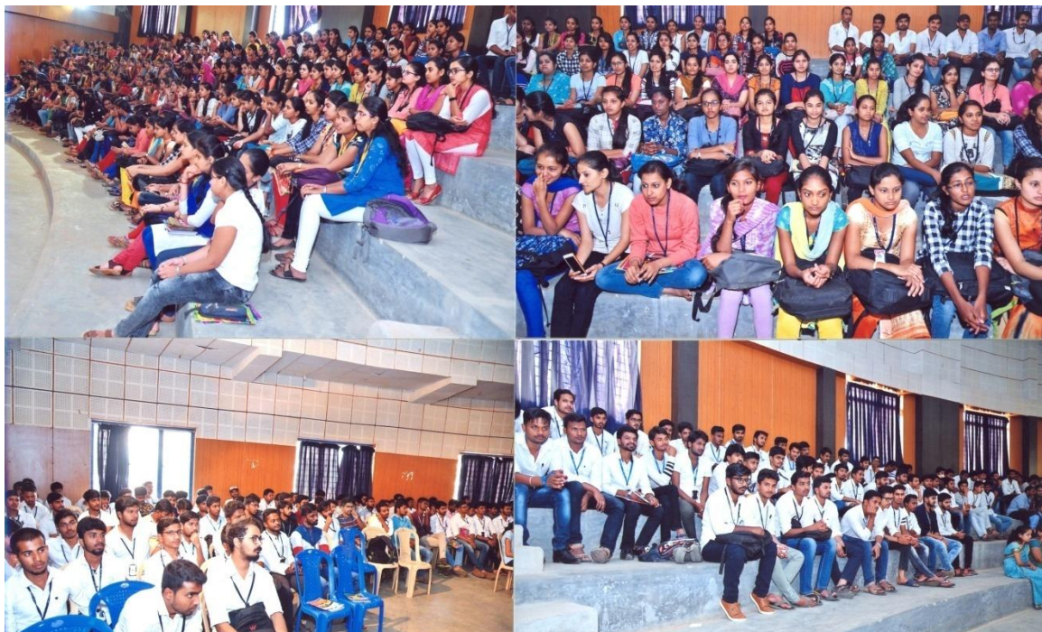
AUDIENCE AT MICROSOFT-PLATIFI FUNCTION IN KIT- AUDITORIUM