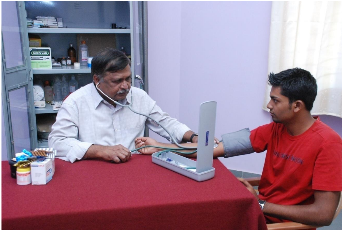
Medical & other facilities at Hostel