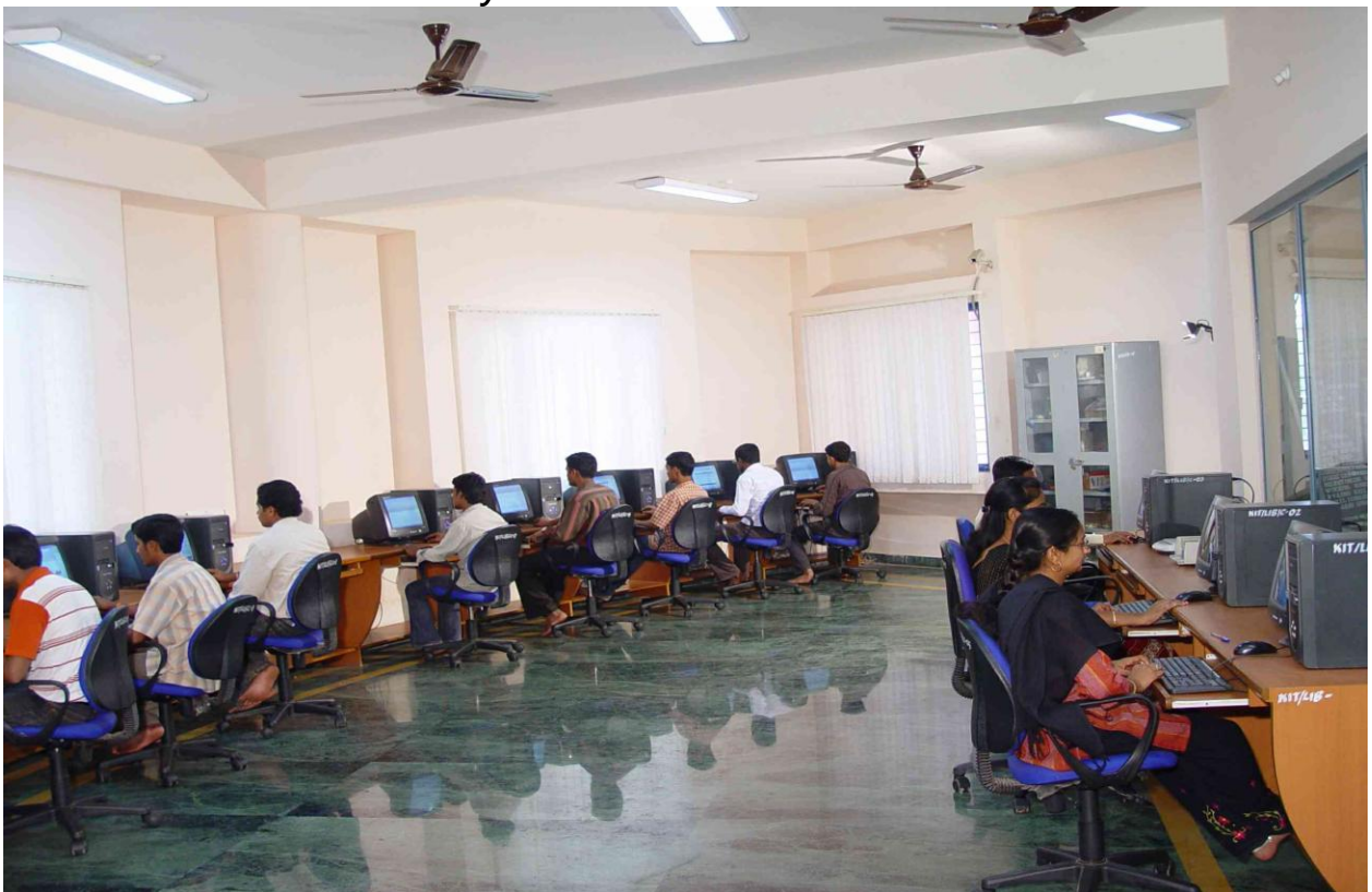
Library – Digital Library