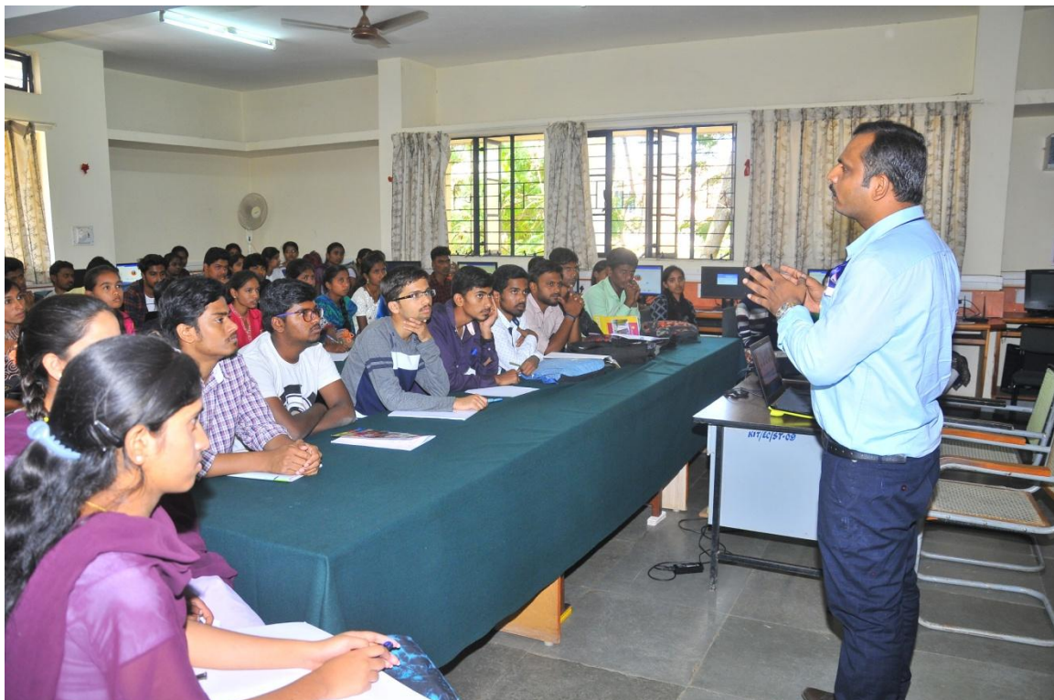
Department of Electronics & Communication Engg. DSP / Computer Network Lab