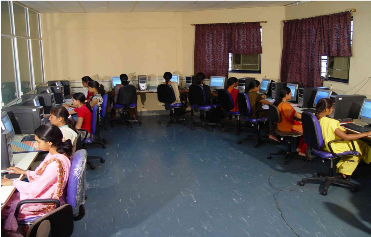
Dept. of Electronics & Communication Engg. VLSI Lab