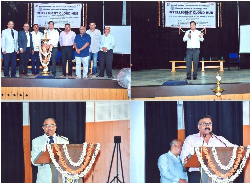
INTELLIGENT CLOUD HUB WORKSHOP BY MICROSOFT- PLATIFI ON 17 TH OF FEBRUARY 2019