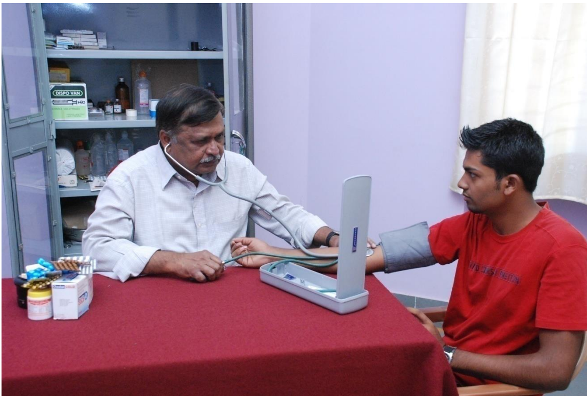
Medical & other facilities at Hostel