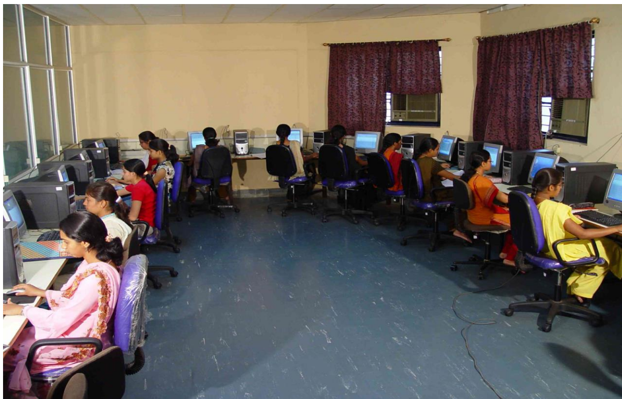
Dept. of Electronics & Communication Engg. VLSI Lab