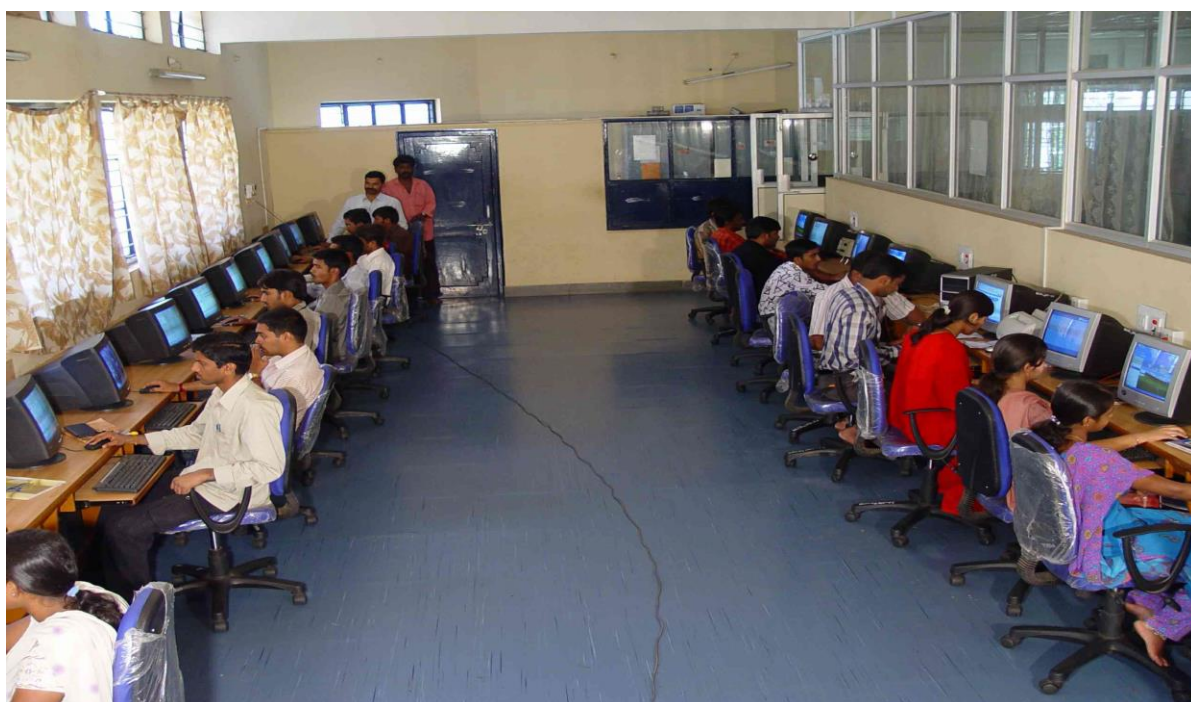
Dept. of Electronics & Communication Engg.