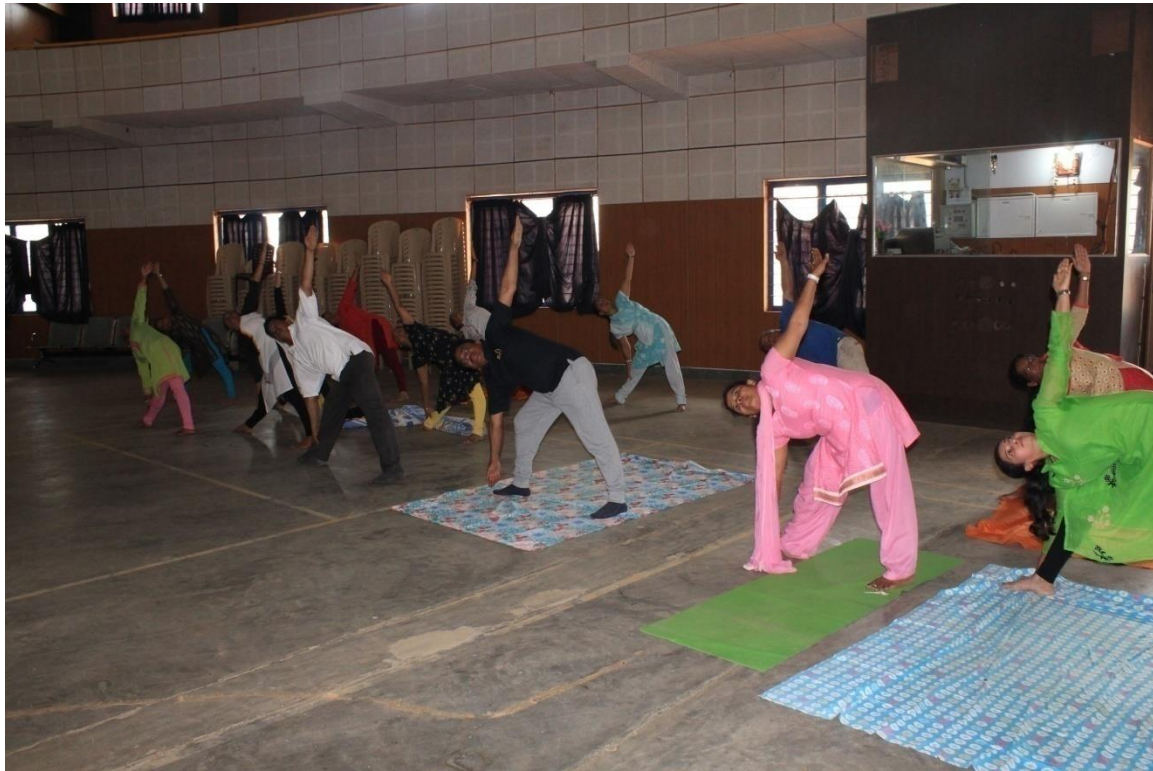
Yoga - Hall