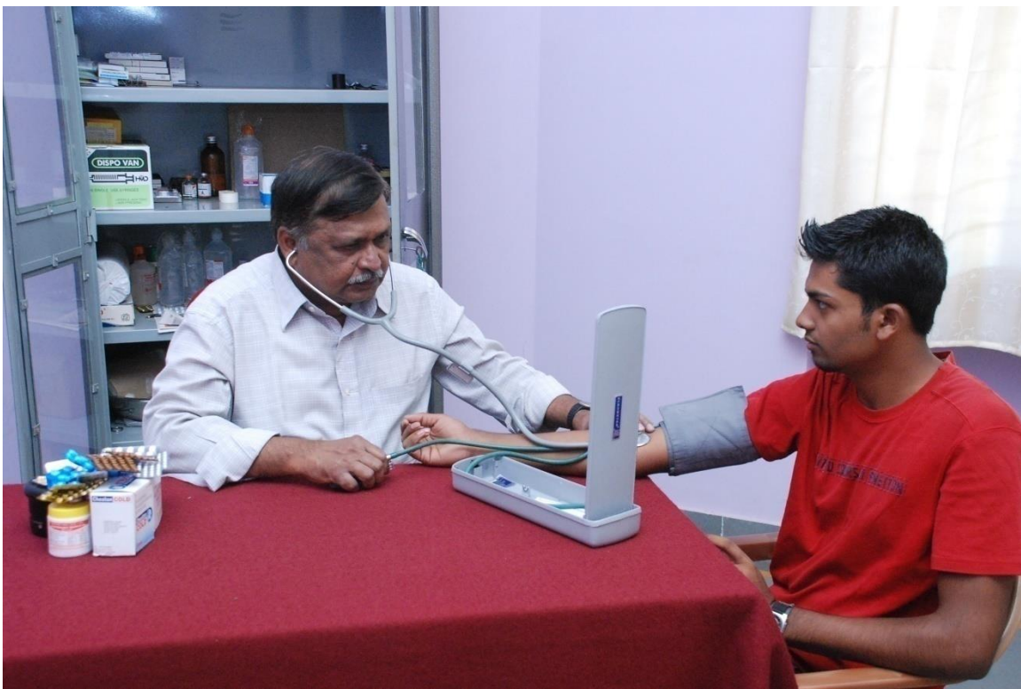
Medical & other facilities at Hostel