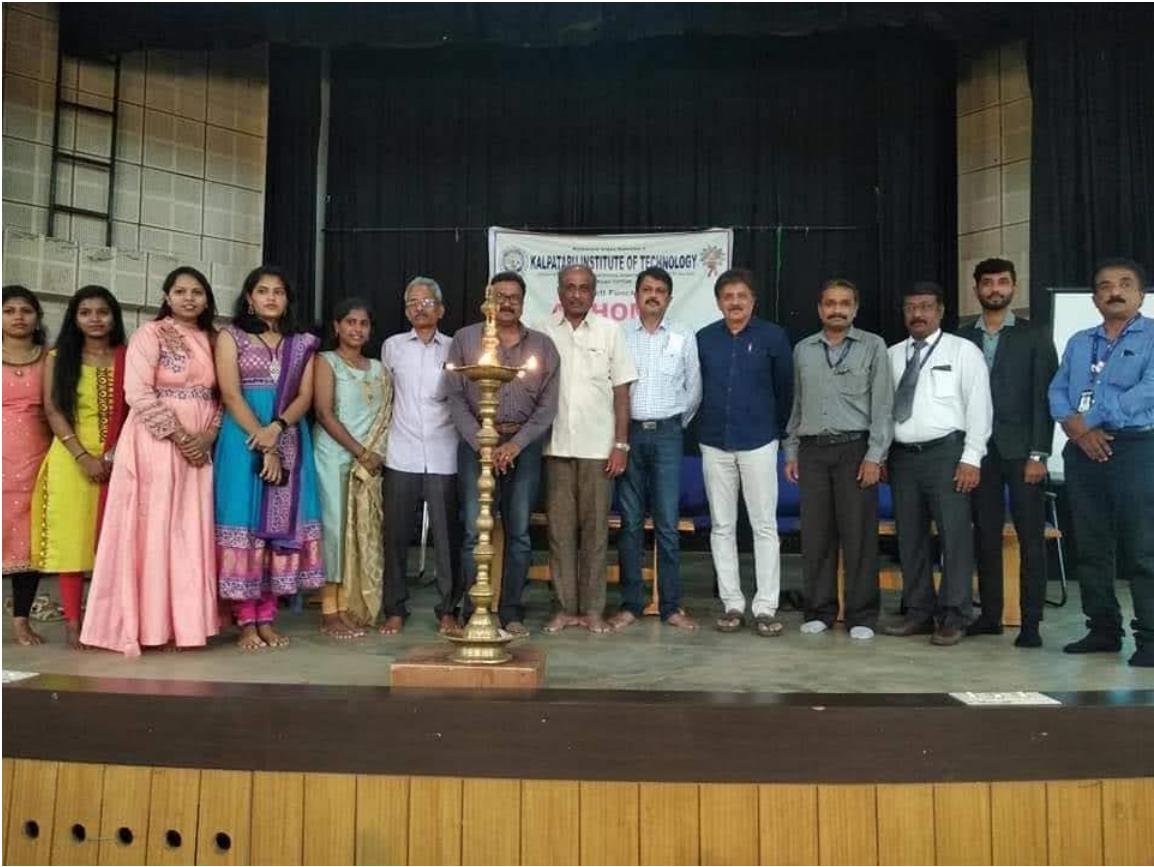
AT HOME Celebration