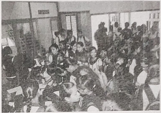
400 students registered